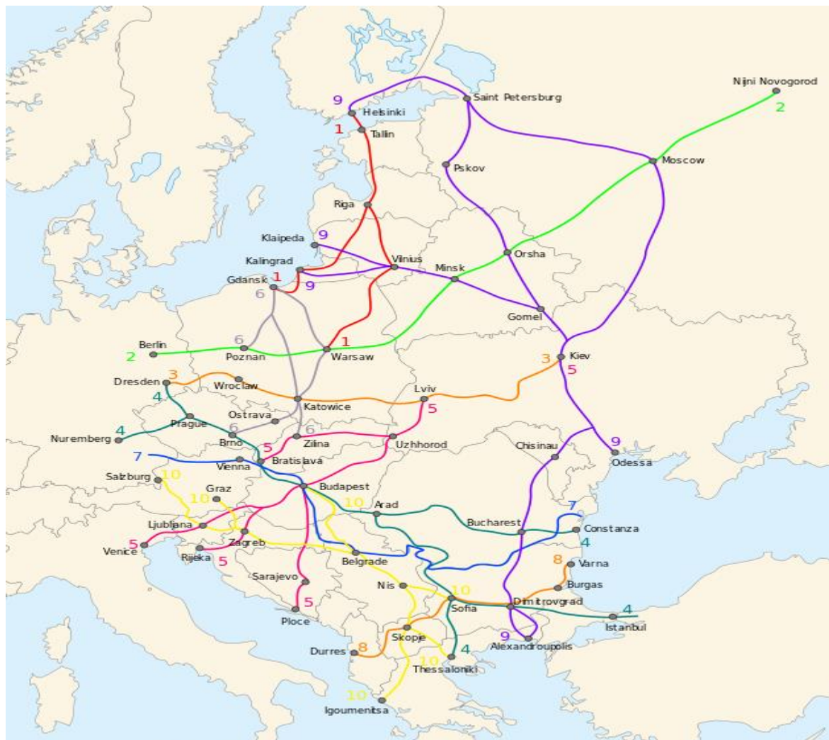
Figure 1 – Scheme of major pan-European international transport corridors

Ukraine has an active policy of supporting European initiatives on international transport corridors, and offers its variants of corridors to the European Community [7]. Currently there are 10 pan-European corridors (Figure 1).